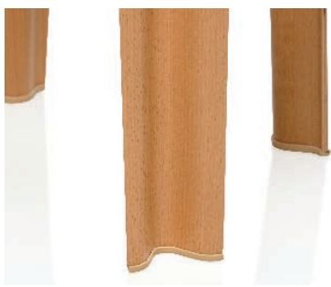
Floor protective feet