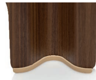
Floor protective feet