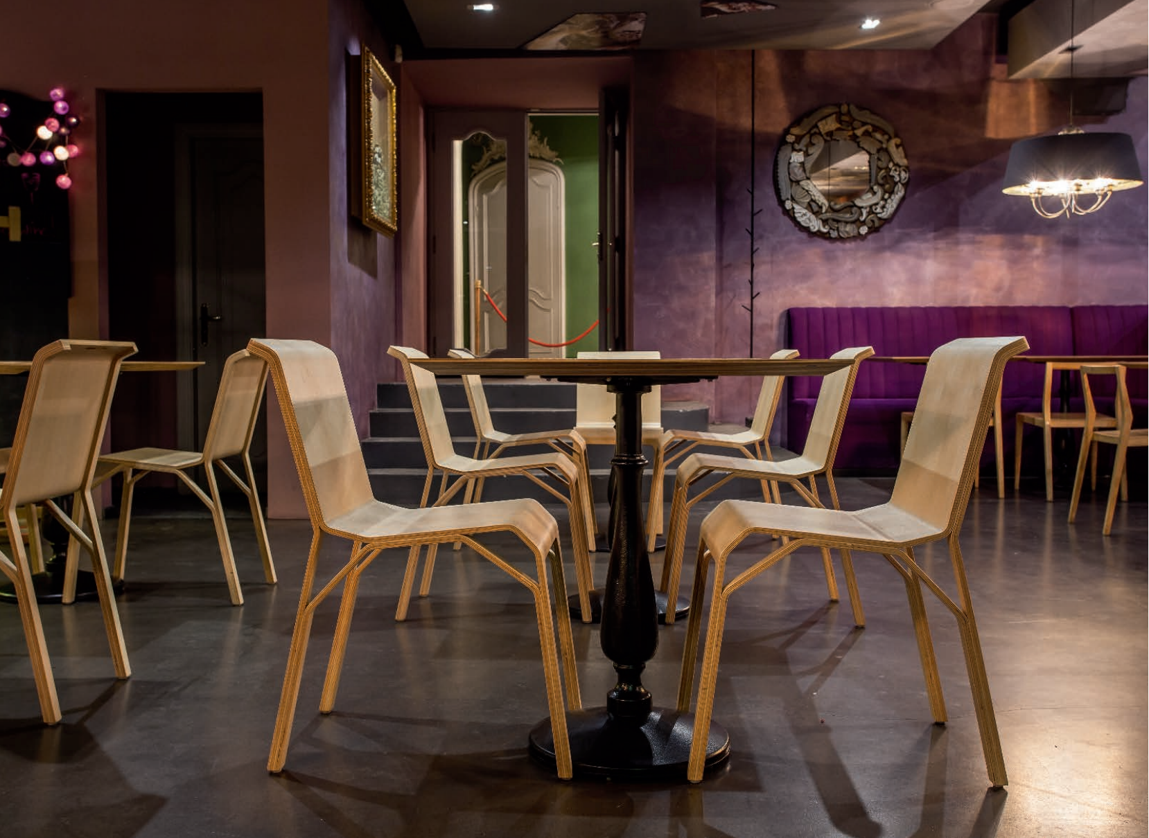
Tinto - wine restaurant